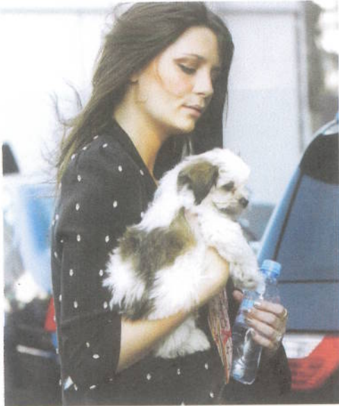
Mischa Barton and puppy looking windswept and mighty cute