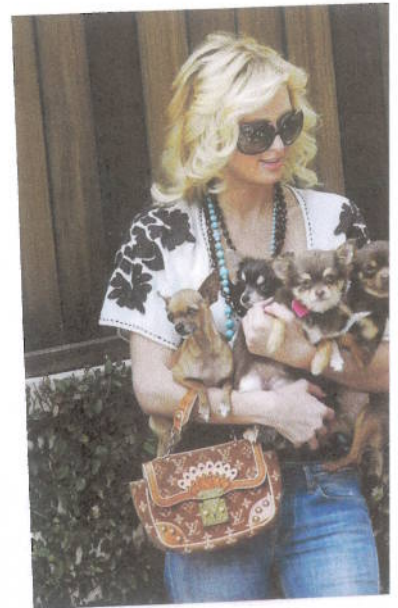
Never one for doing things low key, Paris her entourage of four pups!