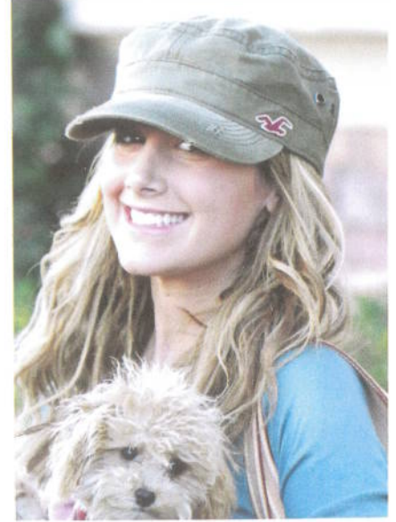
Ashley Tisdale looking sporty with her bundle of adorable fluff

local celebrity and would be missed by all if we moved.