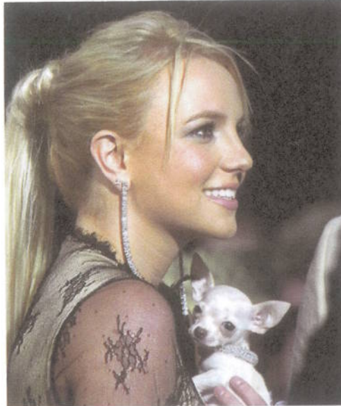
Check out Britney Spears mini me, don't you love the matching collar and earrings!