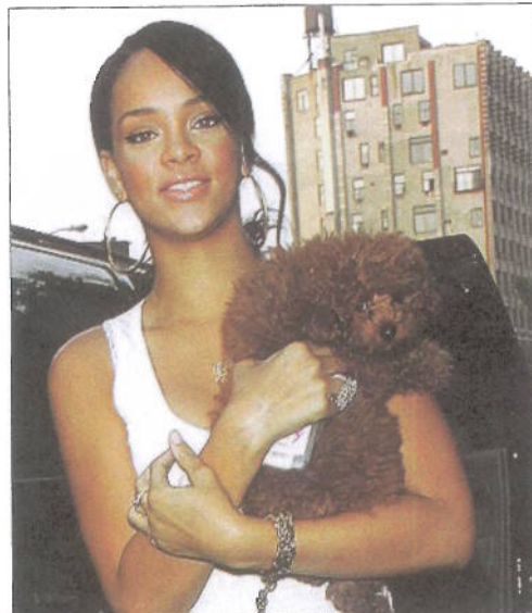
Wow, Rihanna's little cutey looks incredibly like a stuffed toy!

Purchasing a dog is not a one off expense. Vet bills can be very costly so you must budget for