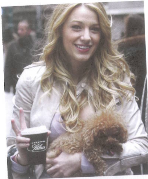
Gossip Girl star, Blake Lively, enjoying a coffee break with her teddy bearesque pup

My decision to invite Tucker into my life was an impulsive one, and the biggest commitment I have made to date. I was responsible for an